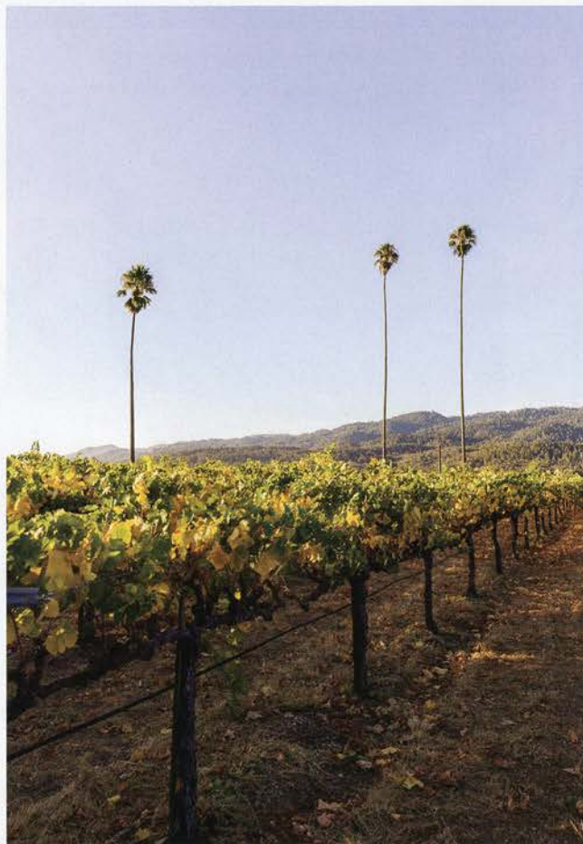
The trademark trio of trees waves above Three Palms Vineyard, key source of Duckhorn's Merlot since 1978. The winery acquired ownership of the site in 2015.